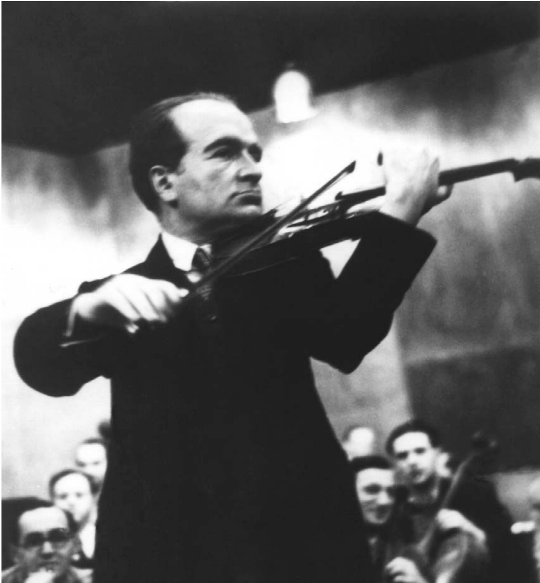
Bronislaw Huberman, violinist and founder of the Palestine Symphony Orchestra