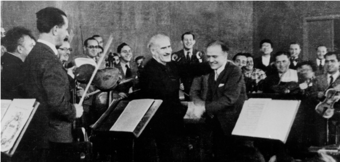
Conductor Arturo Toscanini and Bronislaw Huberman on stage after the first Palestine Symphony Orchestra concert, Nov. 1936.