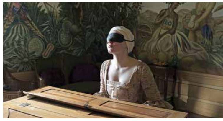
"Sensual, engrossing historical drama." -VARIETY

"An inquisitive and gorgeously accoutered period piece about science, the senses and the position of women in Mozart-era Austria." -THE HOLLYWOOD REPORTER