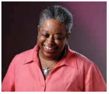
"This film is a conversation starter."